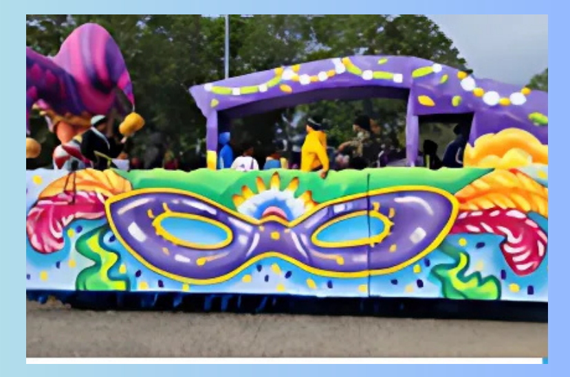
We look forward to continuing our involvement in this vibrant celebration and thank everyone who helped make the 2024 Prichard Christmas Parade a success!

HACP is honored to support this cherished annual tradition, which reflects our commitment to community engagement and creating meaningful experiences for our residents.